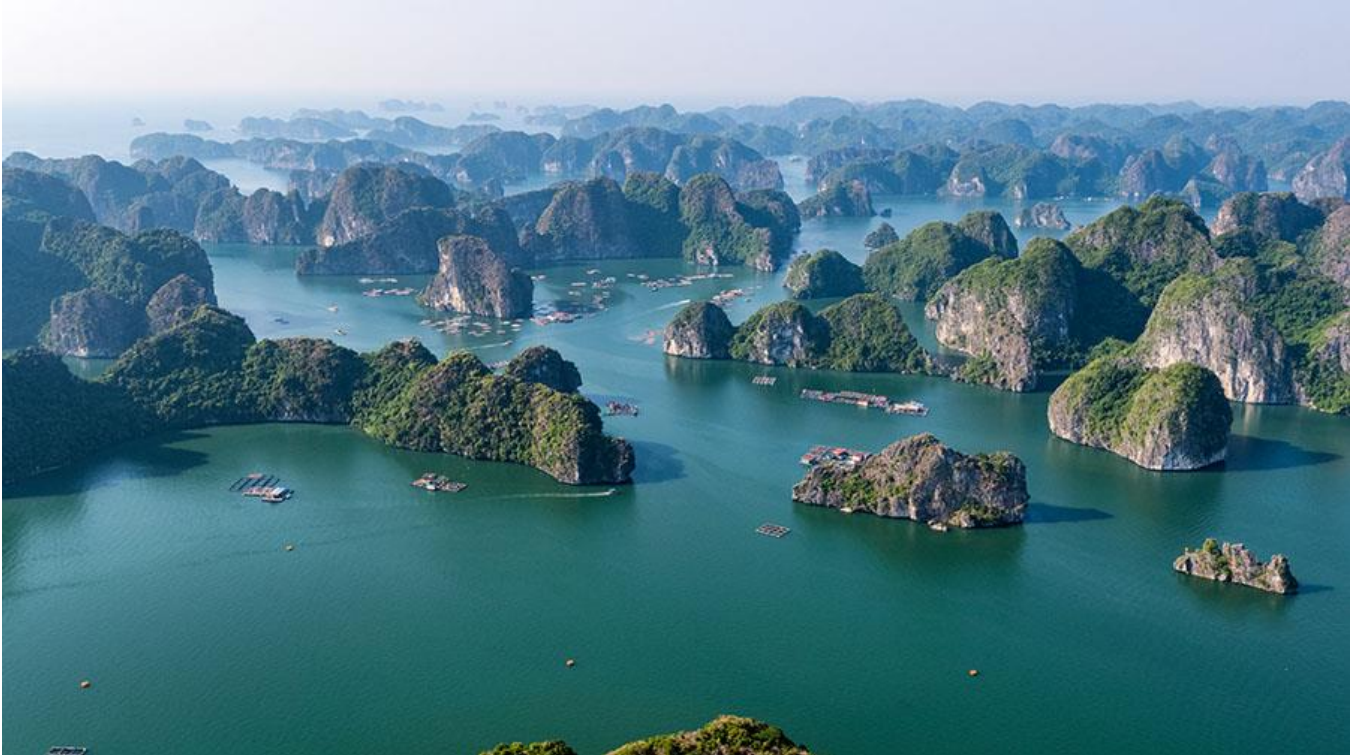
The overview of Ha Long Bay

Morning depart for Ha Long Bay, we go through the scenic countryside. The wondrous Ha Long Bay is truly one of Vietnam's most impressive scenic sights. This exciting cruise will provide us a fantastic view of the picturesque scenery blending with the sky and some 3,000 limestone islands rising amazingly from the clear and emerald water.