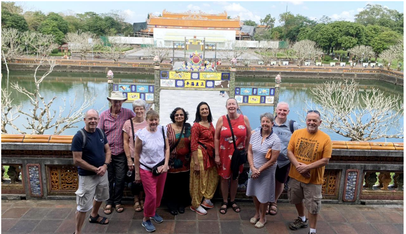
Imperial Capital Of Hue

A scenic drive takes you along the coastline from Hoi An to Hue, the former imperial capital of Vietnam. Then you will reach Hue, the former imperial capital of Vietnam, to visit the ancient Forbidden City from where the Nguyen Dynasty ruled between 1802 and 1945.