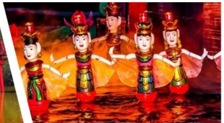
Water Puppet Show