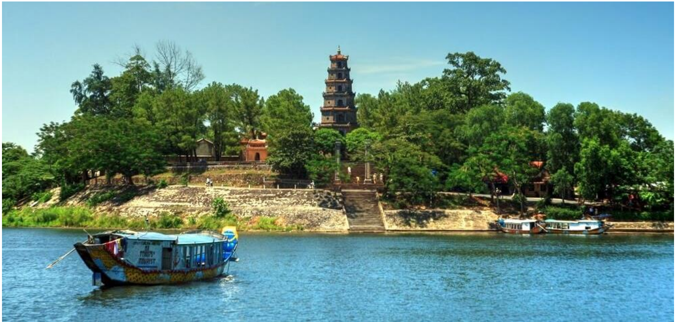
Thien Mu pagoda