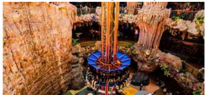
Ba Na Hills Fantasy Park