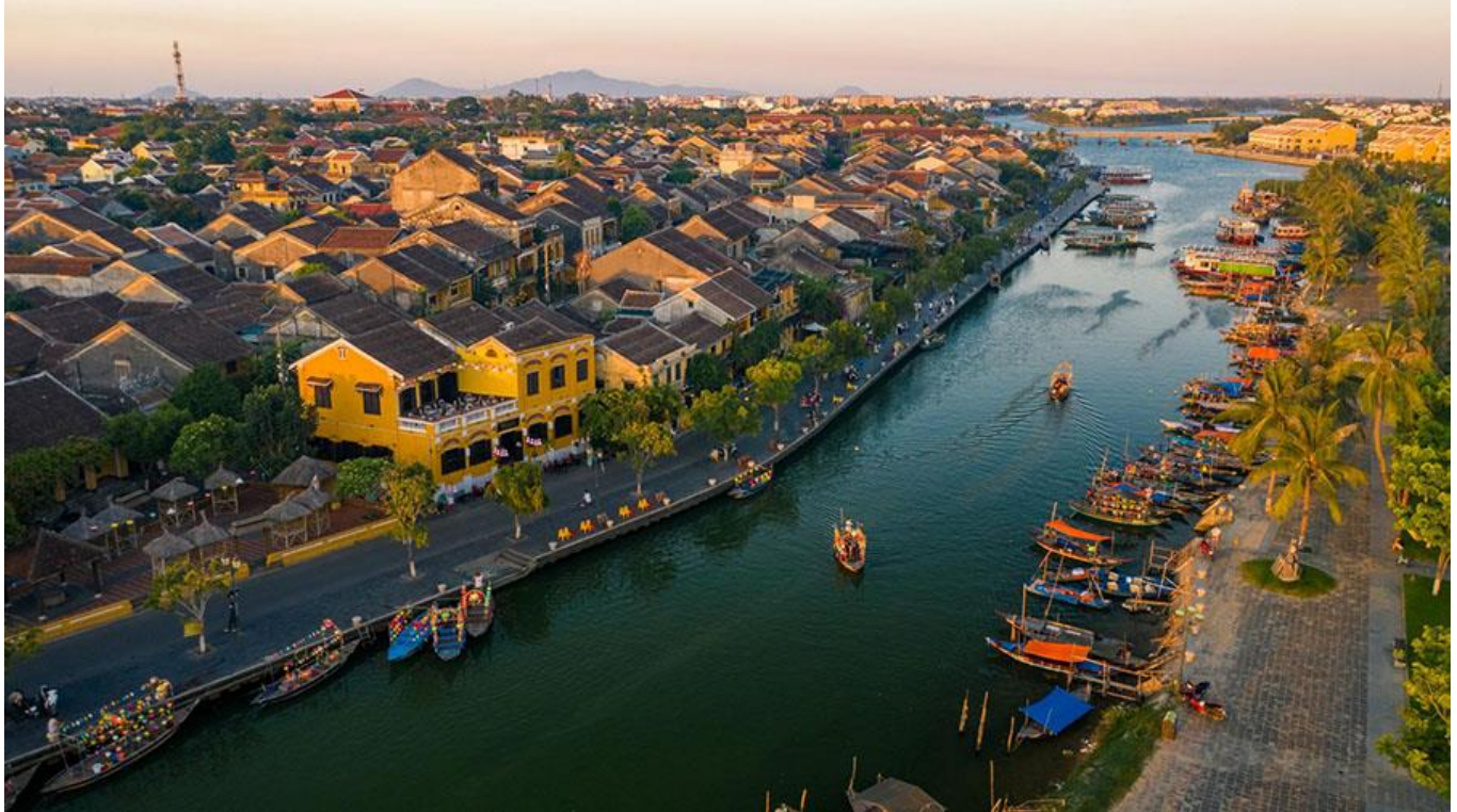
Hoian Ancient Town