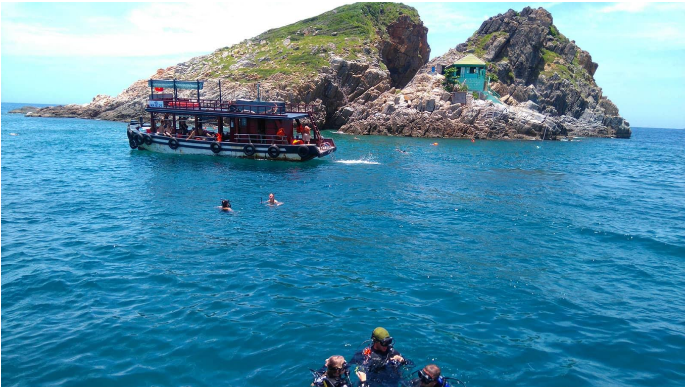
Hon Mun Island

Experience the coast of Nha Trang aboard a boat as you set out in the morning for the first stop at the Tri Nguyen Aquarium . You will then head out to Hon Mun Island where you can swim and snorkel for beholding various kinds of multi – colourful corals and fishes (snorkelling fees paid by yourself), continue to Hon Mot Island for relax.