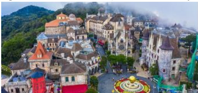
Ba Na Hills

Visit the Le Jardin, old wineries (excluded expenses) - remains of French Villas and Linh Ung pagoda with 27m high Buddha statue. Leave Le Jardin for Gare Debay, the second cable car station, to go to the top of Ba Na