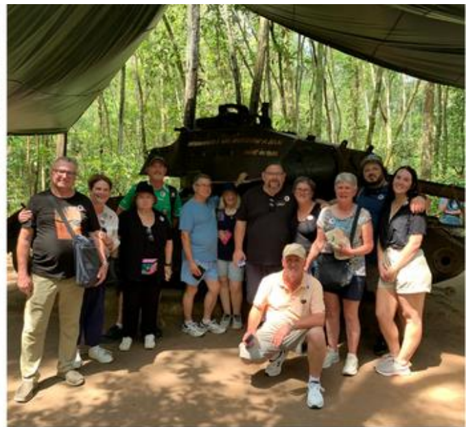
Cu Chi Tunnels