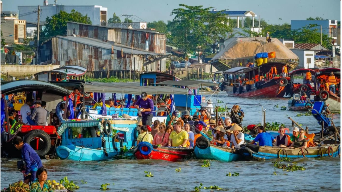
Cai Rang Market

Visit Cai Rang - the market is unique culture of local people living along this mighty river. Instead of shopping in the town, they shop and barter on the river that is more convenient to access by waterways.